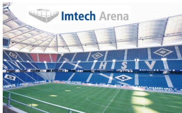
Owned and operated by the HSV soccer club, ImTech Arena needed state-of-the-art Wi-Fi network for data offloading, reliable guest access and Internet access for the press to DT’s T-Mobile’s hotspot service.

Other key requirements included: simplified Wi-Fi deployment and management, easy guest access pass generation, the ability to automatically steer dual-band (2.4GHz/5GHz) clients to the 5GHz band and dynamic beamforming and interference rejection to provide better signal coverage and more consistent performance to devices, such as smartphones, that frequently change their orientation. According to HSV, when large events take place at ImTech Arena, radio and television stations with an assortment of wireless equipment along with tens of thousands of visitors, can quickly saturate the RF spectrum causing major Wi-Fi problems.