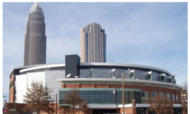
Time Warner Arena in Charlotte, North Carolina

For all other locations in the arena (locker rooms, concourses, back offices,