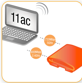
Blinding fast Wave 2 4x4:4 802.11ac with MU-MIMO