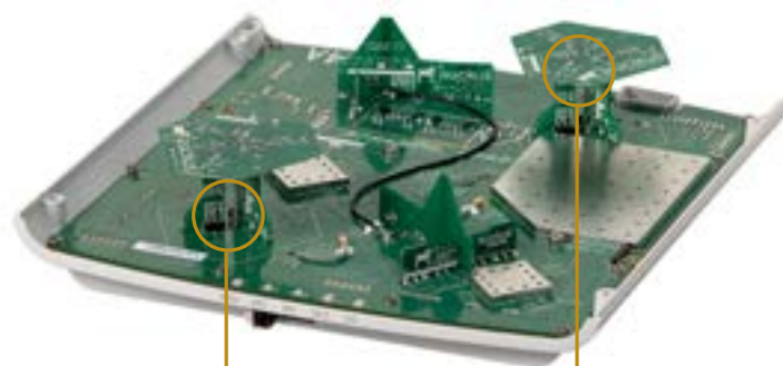
BeamFlex+ Adaptive Antenna Technology