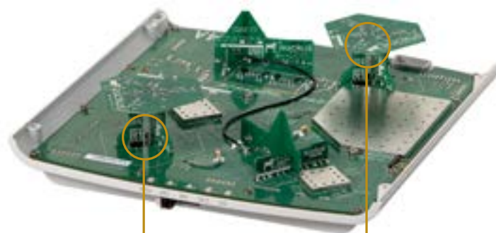
BeamFlex+ Adaptive Antenna Technology